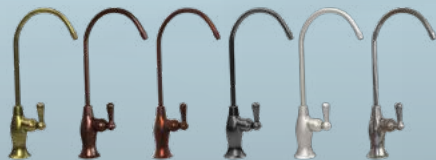
Choice of faucet finishes.