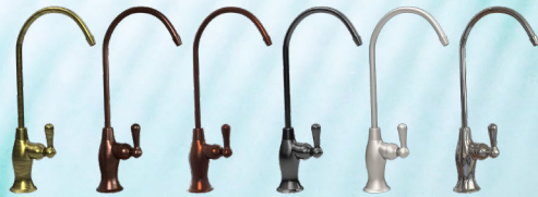
Choice of faucet finishes.

*Ask your water treatment specialist for details.